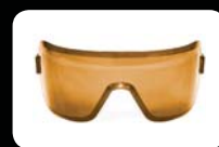
BLUEBLOCKER OUTSERT ASSEMBLY