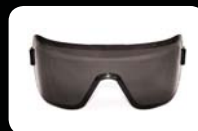
SUNLIGHT OUTSERT ASSEMBLY