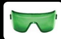
LASER OUTSERT ASSEMBLY