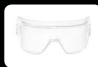
CLEAR OUTSERT ASSEMBLY