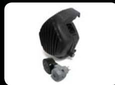
VOICE PROJECTION UNIT