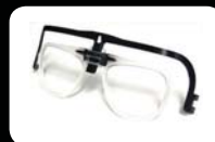
VISION CORRECTION ASSEMBLY